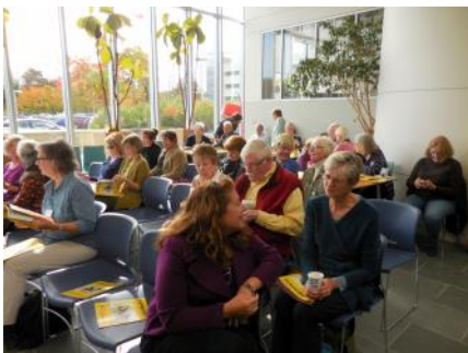
The Reflections reception was very well attended

For yesterday is already a dream And tomorrow is only a vision. But today, well-lived, makes Every yesterday a dream of happiness And every tomorrow a vision of hope. Look well, therefore, to this day.