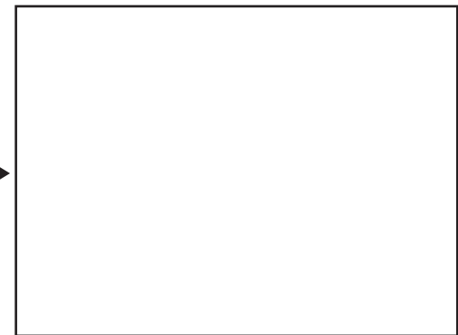
Scene 3: The Future